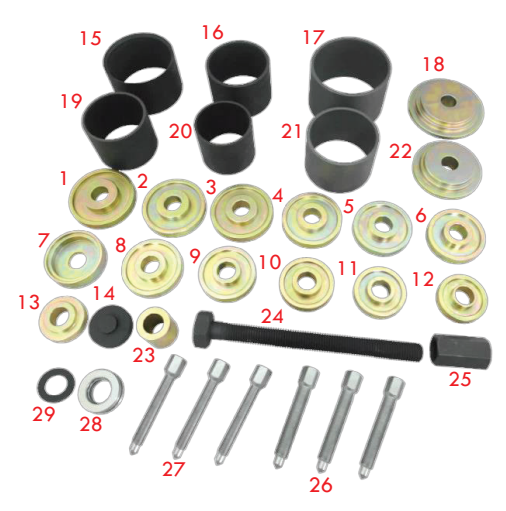
MADE IN TAIWAN